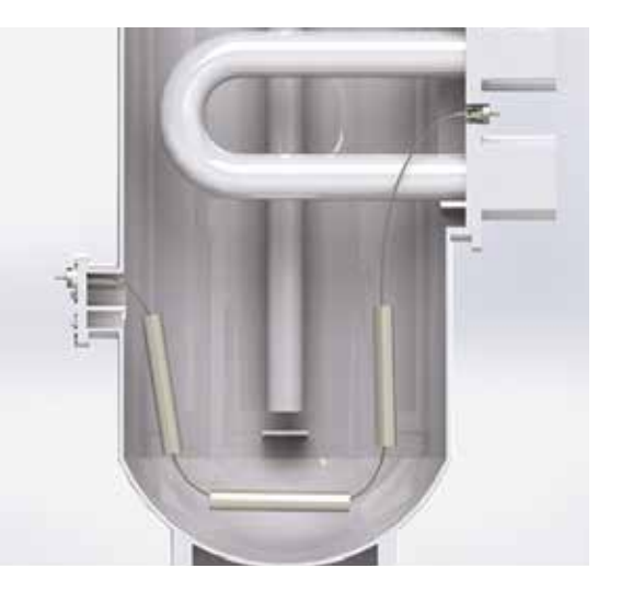
Links can provide up to three times as much capacity as standard cantilevered anodes.