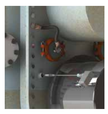
Lower cost, longer life, improved protection and no leaks.