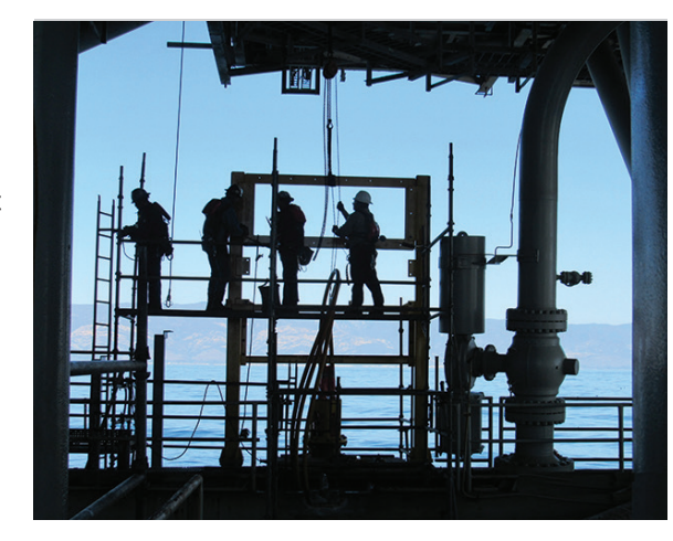
OUT OF HARM'S WAY Junction boxes were raised an extra 11 feet to prevent flooding in high seas.