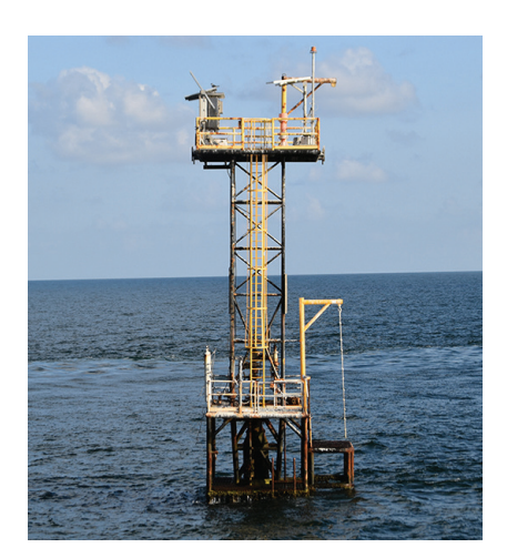
(ANOTHER) PLATFORM IN 66 FT, DEPTH Three 66' RetroLinks™ with 25' leaders were used.