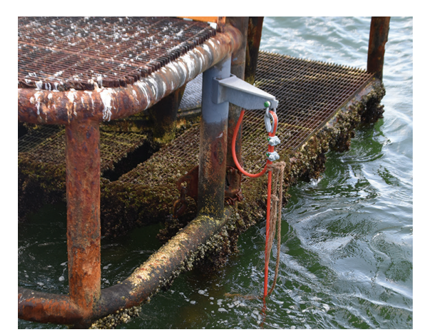
THE RETROLINKS™ WERE HUNG FROM WELDED-ON STAND-OFFS. At least two of the anodes on each string lie in the mud