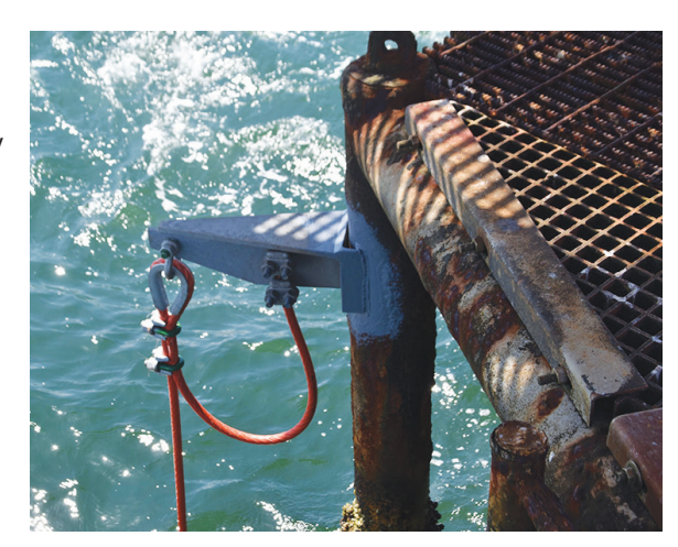
QUICK INSTALLATION IN 66 FEET OF SEAWATER RetroLinks™ are almost always installed from a small boat without divers