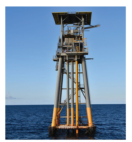
PLATFORM IN 150 FT. DEPTH 11 longer 150' RetroLinks™ with 25' leaders were used.