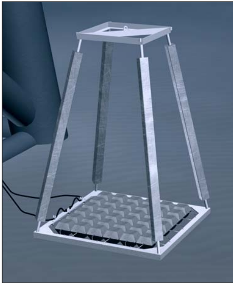
RetroPod in situ sits 10 ft. from the base of the structure on bottom, either inside or outside of the jacket