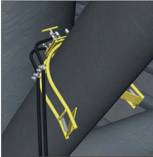
The RetroClamp tie-back in situ. No failures have ever been reported.