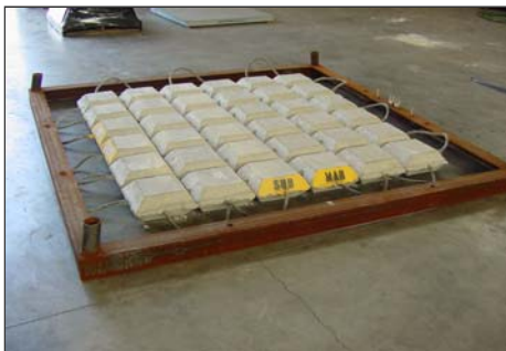
Concrete mattresses provide ample ballast to insure stability at the base