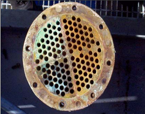
Heat exchanger failure