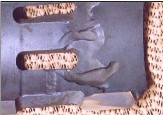
Choke erosion failure